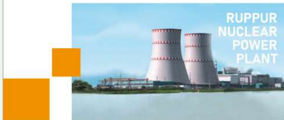
RUPPUR NUCLEAR POWER PLANT